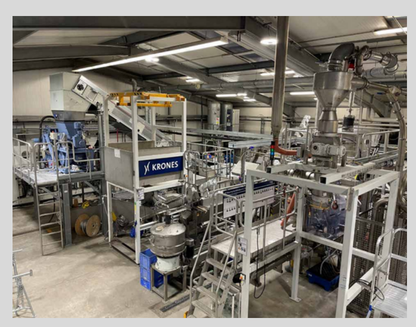
Krones intensive washing pilot plant in Flensburg

The collaboration began with laboratory tests on both PP and PS cups, at Siegwerk's facilities, adhering to DIN SPEC 91496.[5] The tests resulted in complete ink removal, with \Delta E values ranging from 0.5-1.5, well below the acceptable limit of 3. These encouraging results led to the next phase of validating these findings under industrial conditions. For this, Krones, recognized as one of the market leaders in globally supplying hot washing equipment to PO recycling companies, provided their pilot plant, a representative version of the set-ups used in the industry, for conducting large-scale washing tests.