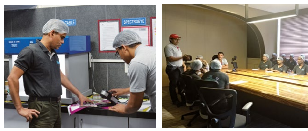
The new high-standard ink laboratory